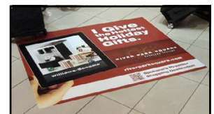
2' x 2' Decal

Exhibit Hall Entrance Column Wrap $3,750 Promote your company brand and presence with a 90.25" (wide) x 92.25" (tall) column wrap at the entrance of the Exhibit Hall. Only 1 column wrap is available.