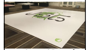
10' x 10' Decal