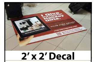
Exhibit Hall Carpet Decals 2' x 2' Set $2,000 Highlight your presence at the Exhibition with a set of five (5), 2 foot x 2 foot carpet decals embossed with your corporate logo and booth location. Only 3 sets are available.

Online Hotel Reservation Web Splash Page $1,500 Put your company logo in front of every attendee who makes their hotel reservation using our online reservation system. December 2024 – May 2025.