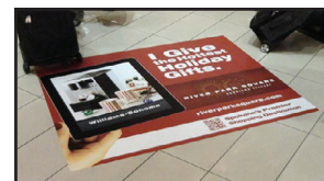
2' x 2' Decal

Exhibit Hall Aisle "Dangler" Banner $1,250/sign Post your corporate logo under the Exhibit Hall aisle markers (4' wide x 2' tall banner). Only 7 "danglers" are available.